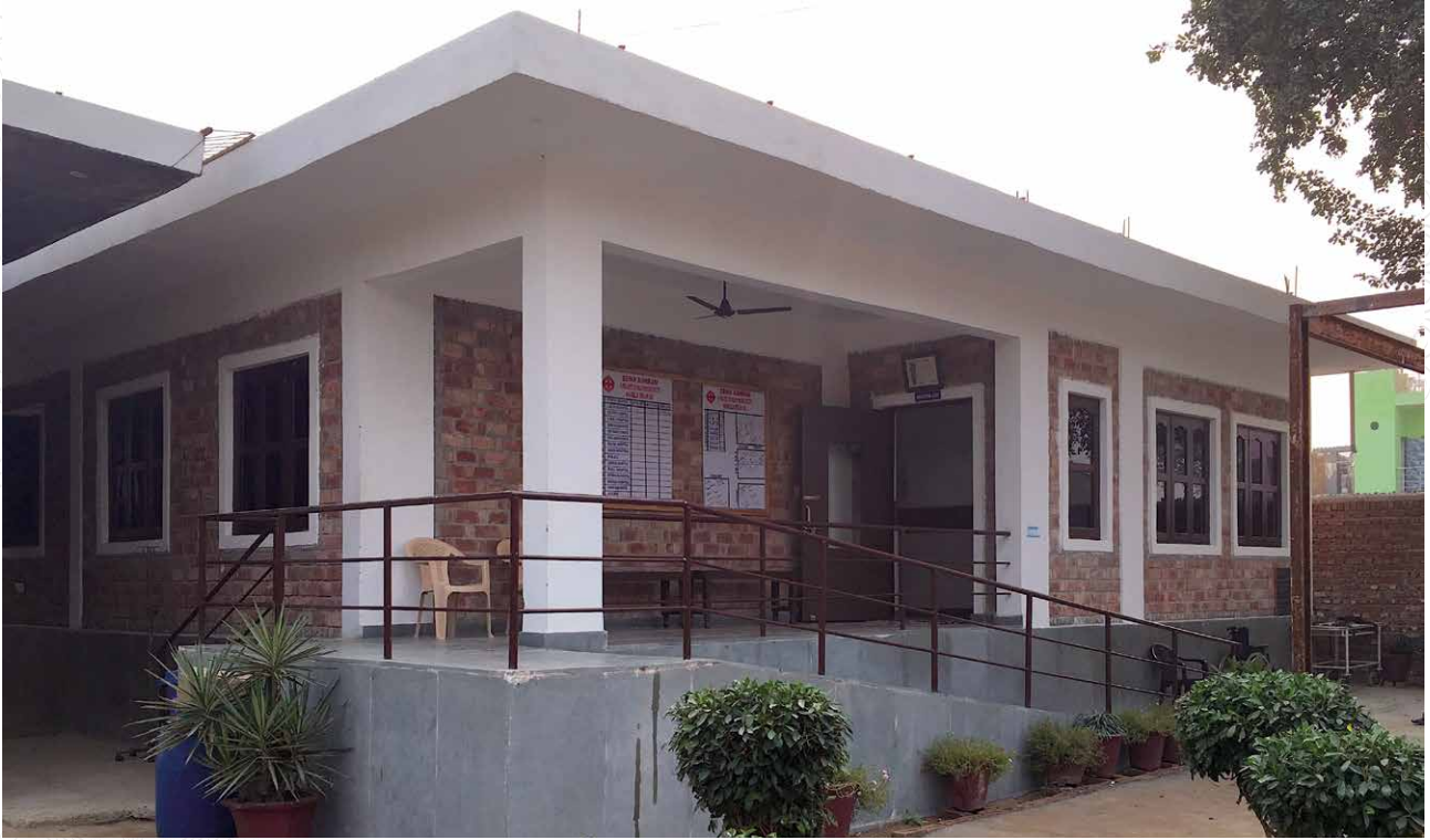
New clinic from the outside