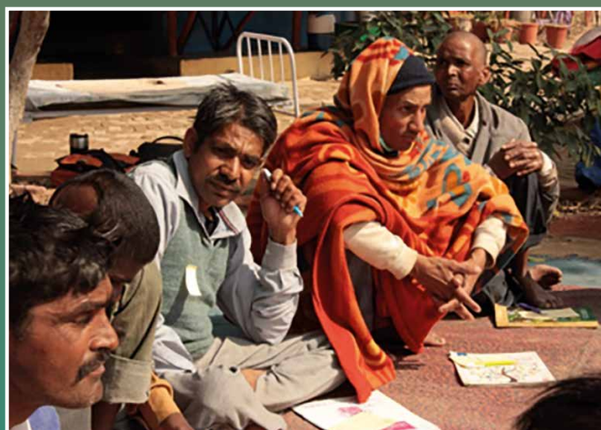
The men of the Ashram present their drawings