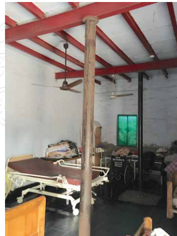
Patient room of the old clinic

For us in the work of Delhi House, the aspect that God does not make any difference in the dignity of the person – whether poor, rich, man, woman, no matter what caste – each person carries the dignity of being shaped by God's image. For us, this is a core value that should also be reflected in our buildings. We also want to treat the poorest of the poor with this dignity and respect and treat them with great esteem and good quality. Sometimes we have heard the phrase: "They come from the street and are supposed to be happy to have a roof over their heads at all!" "Yes," we say, "these people have landed on the street, but when they come to us, they should feel the dignity and love that God feels for them," so we want to treat them with enough space in a functional and good room. After our small clinic (created according to the usual slum construction method)