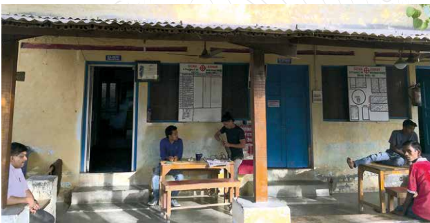
In front of the old clinic

"These people have landed on the street, but when they come to us, they should feel the dignity and love that God feels for them."