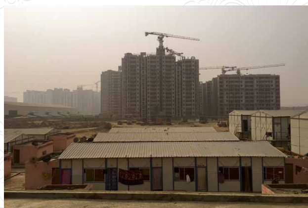
View from the roof of the clinic