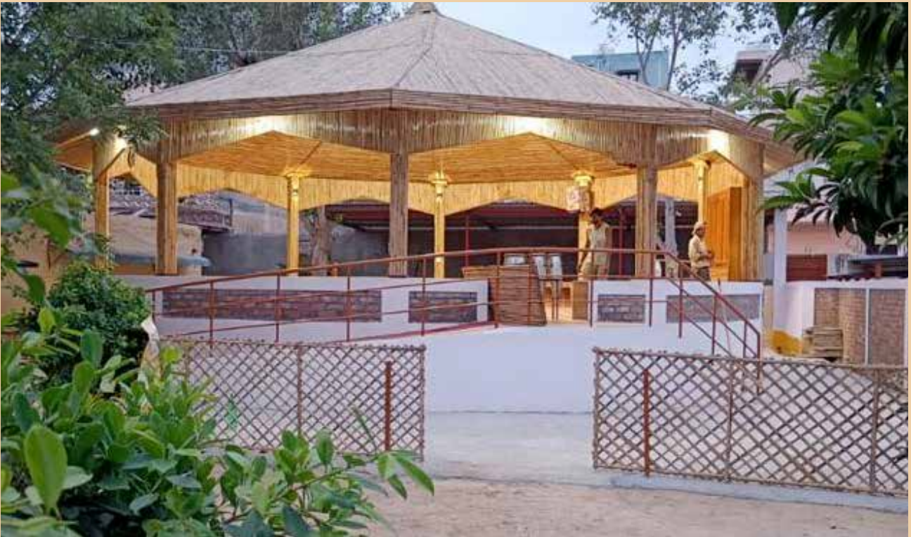
The new Circle on the day of the inauguration

continuing this important function for the community. It should be round again, radiate beauty and be made of organic material.