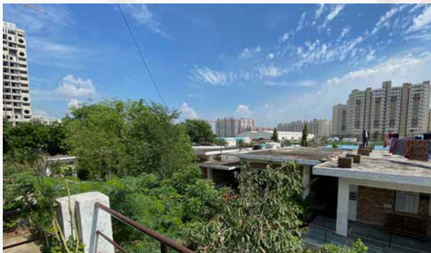
View from the Ashram to the South

The Sewa Ashram and the Learning Center have been surrounded by construction activity for years and are now framed by towering apartment buildings with up to 24 floors. The area has become the largest urban development project of the state-run Delhi Development Authority (DDA).