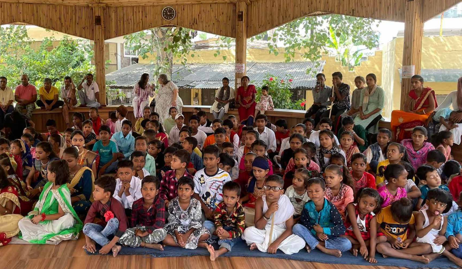
Children from the Learning Center at the Circle on National Day