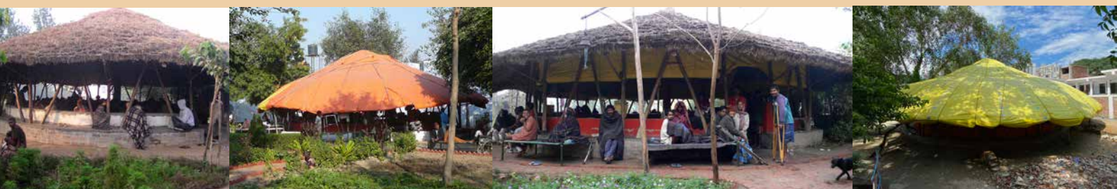
The Circle over the years: 2004, 2010, 2011, 2022

Last year, it was clear that the Circle was in danger of collapsing and urgently needed to be demolished before it could cause any major damage. But it was just as clear that a new Circle had to be built, symbolizing and